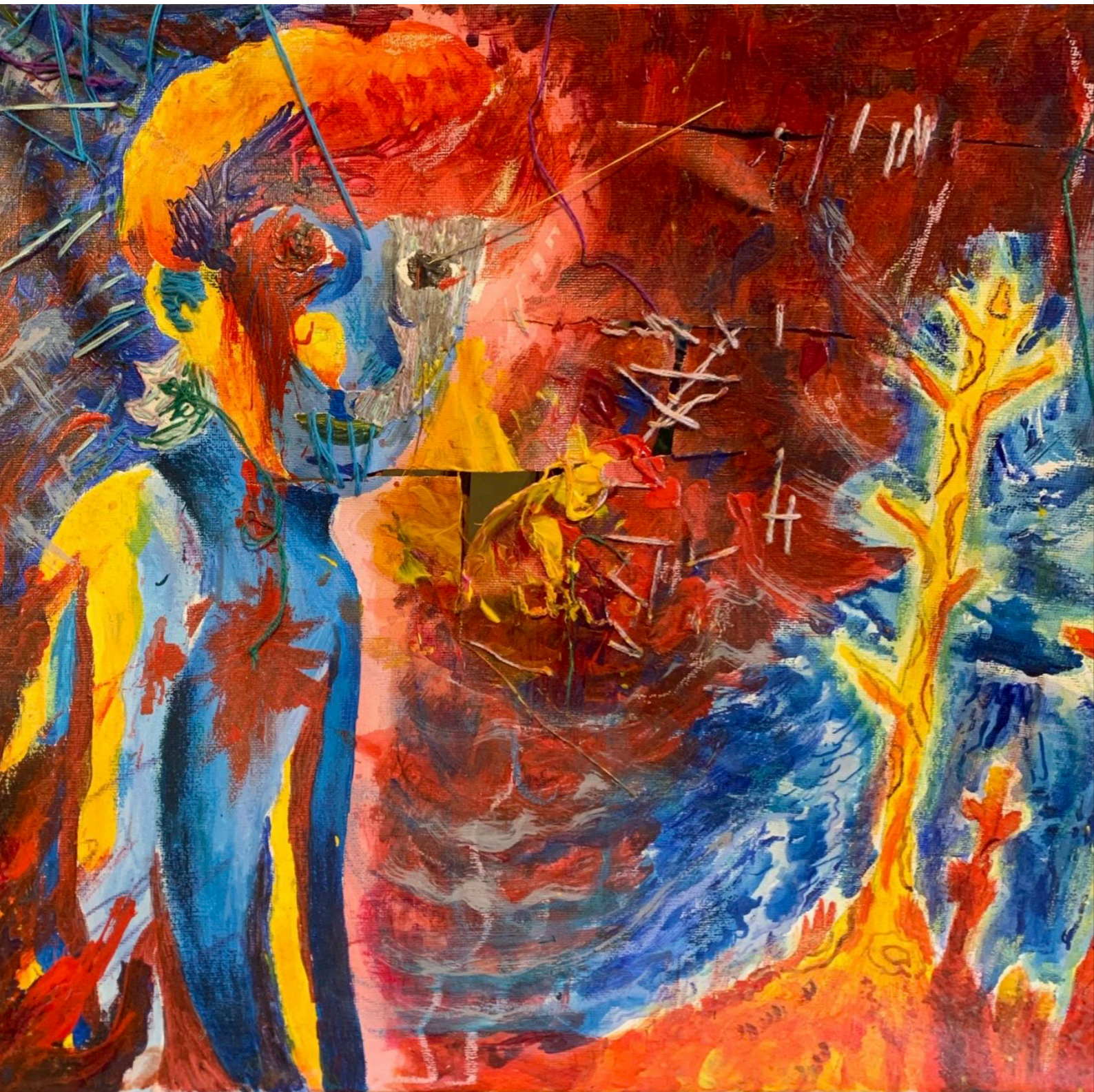
"This one doesn't have name"